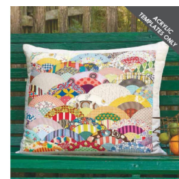
CLAM BAKE ACRYLIC TEMPLATES ONLY Pattern featured in Quilt Lovely BY JEN FINNELL

Jelly Roll Express - Suitable for beginners + Simply machine pieced lap quilt.